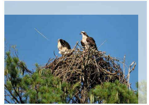
One of our osprey showing his appreciation for our summer hospitality.

Flight training got under way in earnest in August. At first there was just a lot of wing flapping. Then a few easy lift offs and hovering maneuvers just above the nest on good windy days. We missed the maiden flights because before we realized it, all four of them were out of the nest and taking to the skies. During flight it was hard to tell the adults from the youngsters, but not on the landings. The young osprey shrieked all the way in and seemed to grab the nest in panic on the first few go arounds. After a couple of weeks they were right up there riding the thermals with mom and dad.