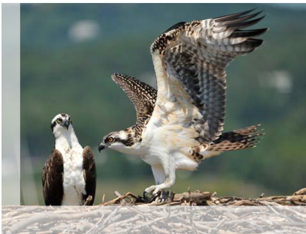
Young osprey in flight training under close supervision of parent. Note young osprey has orange eyes while adult's are a lighter lemon yellow.

We're not sure when the eggs hatched. It was pretty hard to tell what was going on in that big nest 75' above the ground.