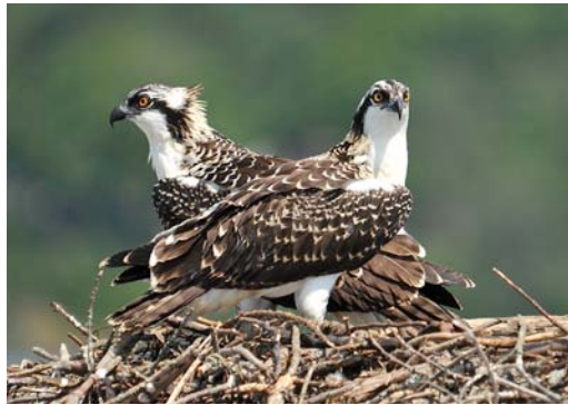
The osprey's nostrils, feathers and feet are all specially adapted for fishing

These guys did everything on the wing .... well, almost everything. The next activity we observed was mating ... lots of it ... but that all took place while they were perched on nearby tree limbs and right on their nest. After all their work building that nest I guess they wanted to be sure it was going to be put to good use. Mating was always very quick (nothing new there) but instead of a nap afterwards it was right back to nest