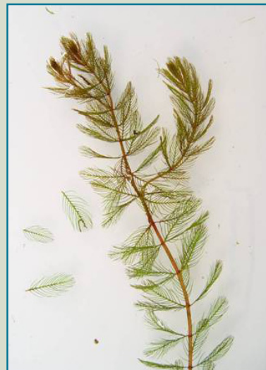
Non-native Invasive Variable Leaf Milfoil.

The Belgrade Lakes Association (BLA) and the Belgrade Regional Conservation Alliance (BRCA) work hard to minimize Phrank's invasion. BRCA acquires land around the watershed to protect and preserve open space that can also be made available to the public for recreational purposes. Except for natural run-off Phrank does not otherwise operate in these venues. BLA, the protector of Great and Long Pond, focuses more on water quality and invasive plants and also contributes toward land acquisition. BLA administers the State LakeSmart program on Great Pond and Long Pond which encourages and rewards residents for implementing measures to minimize phosphorus run-off. Phrank cringes every time he sees a white sign tacked on a tree, indicating the property owner is the recipient of the coveted LakeSmart award.