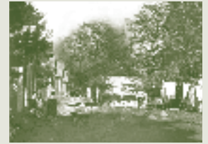
"Broadway" at Camp Under the Pines on Taconnet (Joyce's Island), 1897.